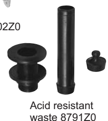
Acid resistant waste 8791Z0