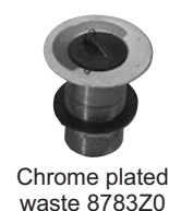
Chrome plated waste 8783Z0