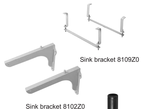
Sink bracket 8102Z0